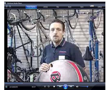
Pi in the Real World Video

Advanced Communication Solutions Ashmore Family Bender Family Callison Family Curran Family Diamond Management and Technology Consultants Emerson Process Management Gantt Family Greisdorf Family GS Dallas Hale Family Hirsch Family Foundation Junior League of Plano Tett Family Plunk Family Bibby Family Matthews Family NEI O'Meara Family Raytheon Schultz Family Sprock Family Tschoepe Family Wacker Family Watson Family Yaeger Family